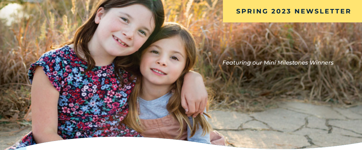
Featuring our Mini Milestones Winners